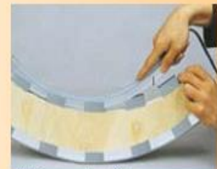
7. Concave Installation