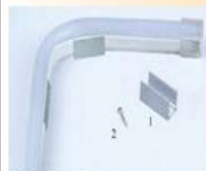
4. 90° Installation