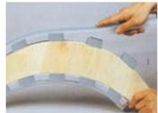
6. Convex Installation