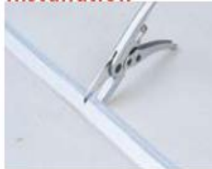
1. Cutting Mark

There are marks along the rope indicating where to make cuts.