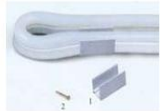
5. 180° Installation

There are marks along the rope indicating where to make cuts.