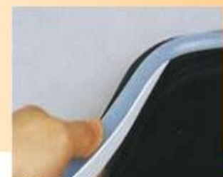
8. Slot Installation