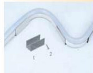
3. Curved Installation