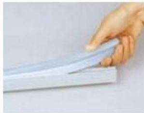
2. Linear Installation